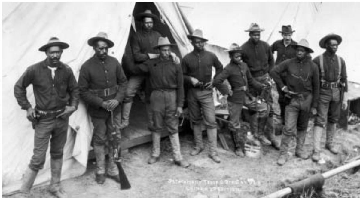
Troop C, 9th Cavalry at Camp Lawton, Seattle, before embarking to China for the Boxer Rebellion, 1900. During the year-long Boxer Rebellion, a Chinese society (called the Boxers by westerners), whose goal was to exterminate all foreigners in China, fought to remove foreigners from the Legation Quarter of Peking.