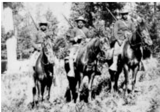
Members of the 24th Infantry on mounted patrol, Yosemite National Park, 1899.