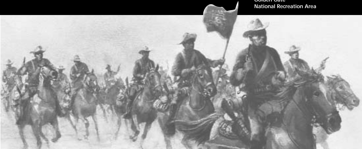
Painting courtesy Arthur Shilstone

Presidio of San Francisco Golden Gate National Recreation Area